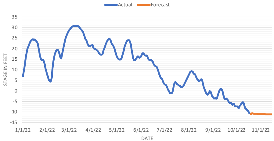
As of October 18th, 2022, the US Army Corps of Engineers, reported the water level at Memphis, TN at -10.65 ft and is forecasted to move lower.