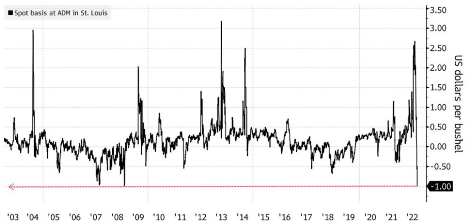
Spot Basis at ADM in St. Louis

Elevators around the Mississippi River are now being forced to store grain longer since barge capacity has decreased. Because barges aren’t able to be filled, available storage at elevators is becoming scarce. Elevators are deterring producers by offering less than current futures prices for their grain due to the lack of storage. These lower cash bids can eat away at the Arkansas grain producers’ bottom lines. Typical basis at harvest would be around 20 cents under the futures price, farmers are facing anywhere from 80 cents under