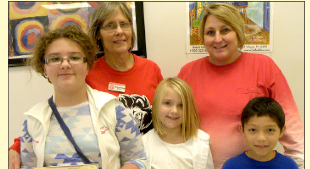
Monroe County, (Poster Contest winners)