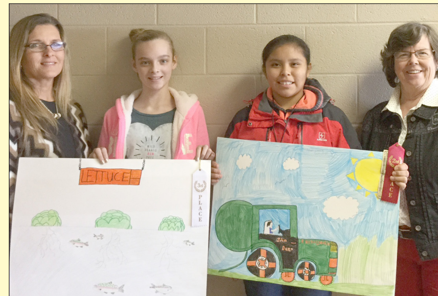
Van Buren County, (Poster Contest winners)