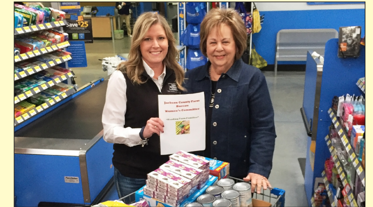
Jackson County, (Back Pack Program donations)