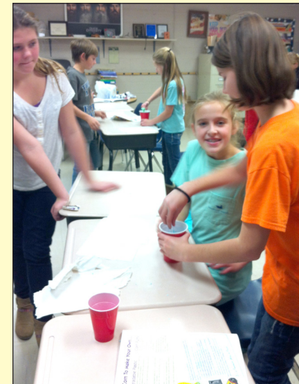
Cleveland County, (Making corn putty)