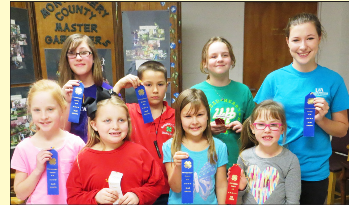
Montgomery County, (4-H dairy contest winners)